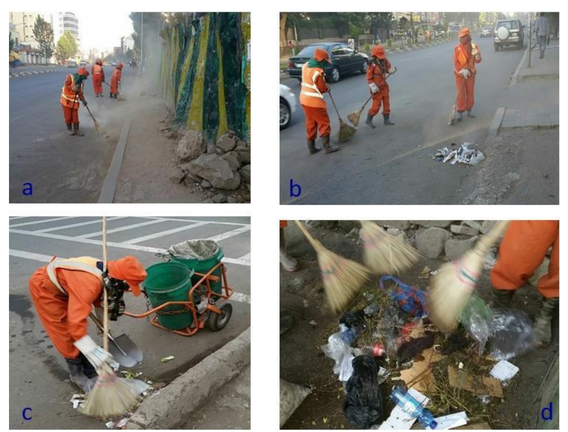
Figure 3: Street sweeping: a-Sweeping; b-collecting; c-dumping litters into dust bin; d-Sorting litters, Nov 2016

The exposure to dust presumably depended on the time covered and the intensity of sweeping. The first km had much sweeping and heavy dust plumes, as the sides are routinely busy with accommodating taxis and road-side businesses such as street food selling and many other nameless petty things. These activities are known to involve massive human movements which leave themselves things like litter, dirt, papers, plastic bags, leaves and straws of khat , used mobile phone cards, card boards, and debris (Figure 3).